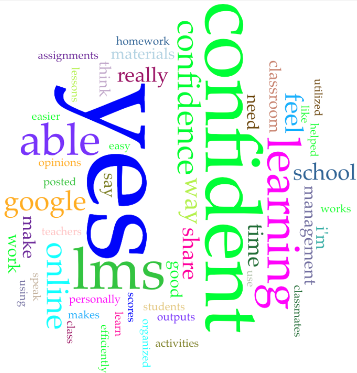
Most frequent words in the corpus: yes (43); confident (23); lms (13); learning (11); able (10)

Figure 4 presents the responses of the student participants to the question about learning management system and its connection to students' building of confidence. A total of 43 "yes" responses were recorded which manifests that students find learning management system a capacitating tool for enhancing their confidence, which is linked to the response "confident" with a total of 23. Moreover, 10 respondents answered "able" which is in line with the claim that students find learning management systems instrumental in making them become more confident.