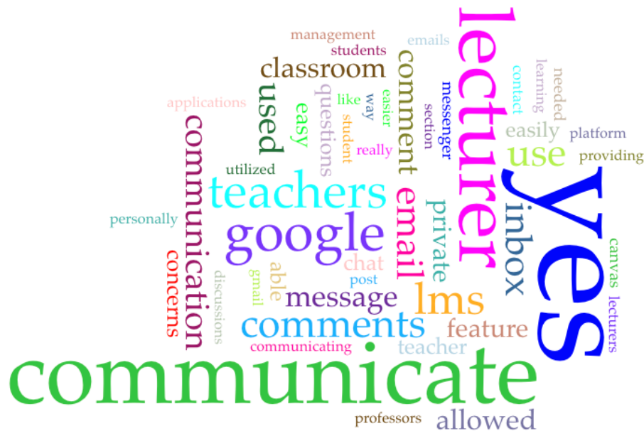
Figure 2. Learning management system and students' communication with lecturers

Most frequent words in the corpus: yes (49); communicate (24); lecturer (23); google (13); teachers (12)