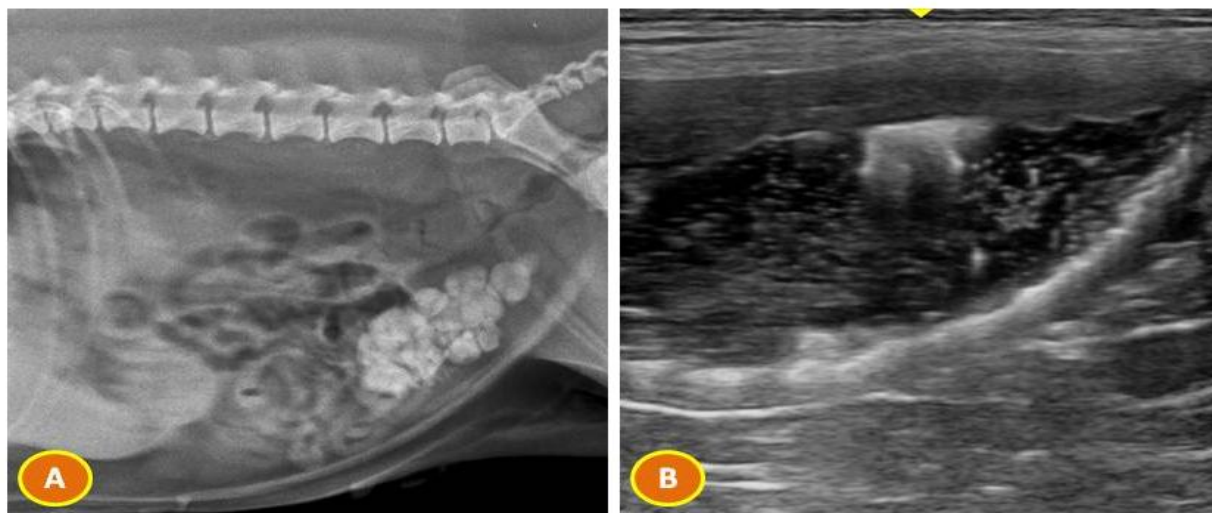
Figure: 1. Radiographic (A) and ultrasonographic (B) diagnosis of cystic calculi in dogs.