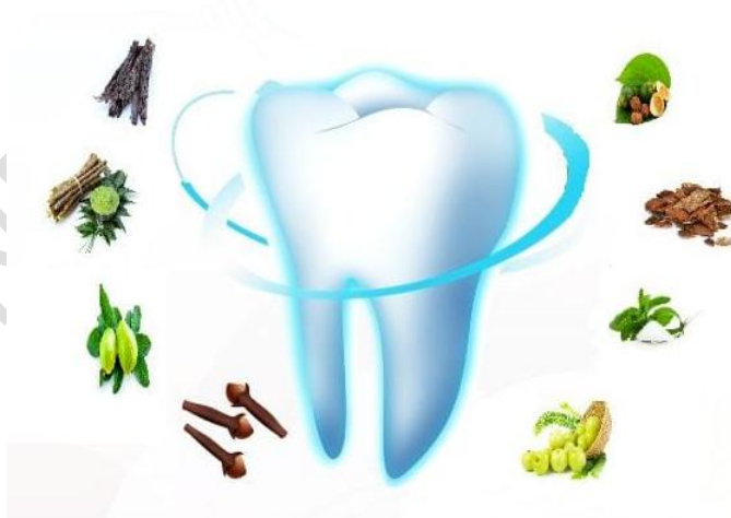
Figure 1 Herbal ingredients used for healthy teeth

A paste or gel dentifrice which is used to clean and maintain aesthetics and health of