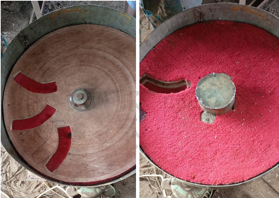
Plate 1: Principle of operation

The collector is a flat inclined plate where the dehulled groundnut seeds falls. Due to its slit, it allows easy outward movement of the dehulled groundnut seeds (Plate. 1).