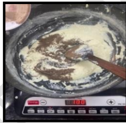
Addition of jamun seed