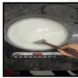
Heating with continous stirring