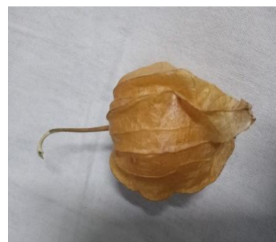
Figure 4 Mature fruit closed by calyx