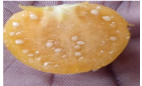
Figure 6 Seeds in cape gooseberry fruit