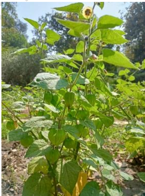
Figure 1 Plant of Cape gooseberry

Cape gooseberry Physalis peruviana L. is an annual growing fruit crop belonging to the family Solanaceae. The plant of cape gooseberry is herbaceous or soft wooded plant usually reaches 2-3 feet height. Cape gooseberry is extensively grown in tropical and subtropical region of the world. The latitude ranges is about 45 0 S and 60 0 N, it can be grows at high elevation up to 500-3000m from asl 1600-9800ft. The fruit is small with 1- 3.5cm in diameter yellow orange berry fruit enclosed by the large accrescent epicalyx and resemble tomato in shape with sweeter taste, better aroma and higher pectin content. It is also commonly called Poha or Poha berry in Hawaii, Golden berry in South Africa and Rashbhari, Makoi, Tepari, Husk cherry, Peruvian ground cherry in India. The name of cape gooseberry is most probably derived from the name of “Cape of Good Hope” of South Africa where it was commercially grown. The ripe fruits are eaten as fresh fruit and used in making excellent quality of jelly, sauces and particularly jam for which it is called as “Jam fruit of India” The fruits are also