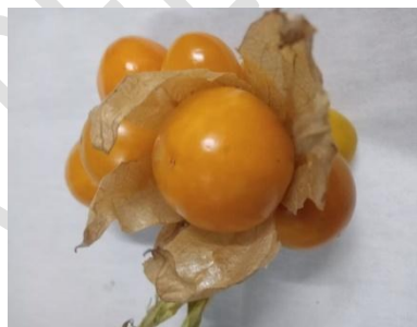
Figure 3 Open calyx of cape gooseberry