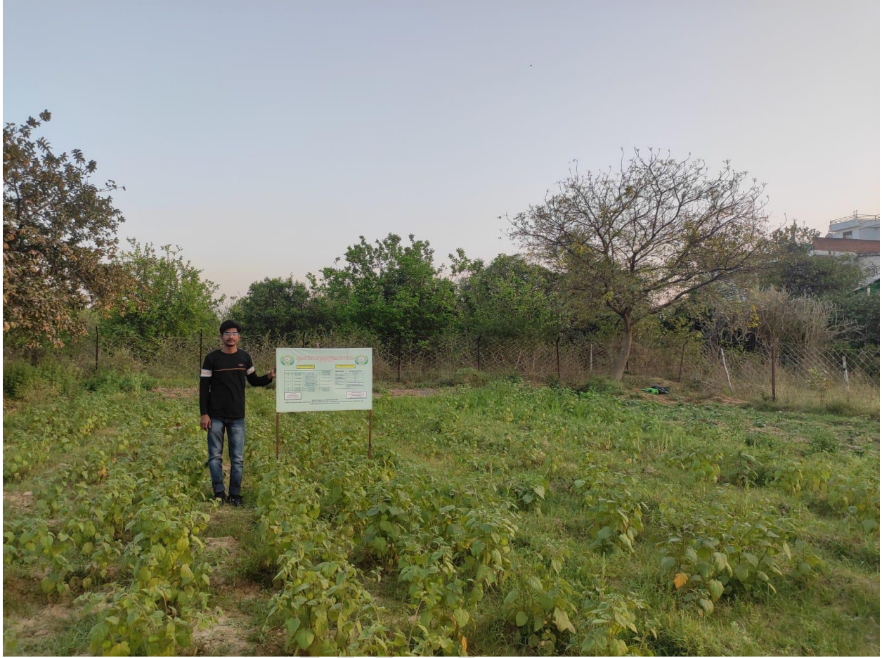
Figure 5 Cultivation of cape gooseberry