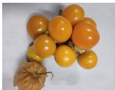
Figure 2 Mature fruit of cape gooseberry

Cape gooseberry Physalis peruviana L. belongs to the family solanaceae. The family solanaceae contributes a number of economic crops such as potato, tomato, brinjal, chilli and cape gooseberry belonging to different genera. The special features of this family are taproot system, stem- erect or climber, Leaves: Alternate, simple or pinnately compound is exstipulate; reticulate venation and the gynoecium is bicarpellary and syncarpous with superior ovary having axile placentation. The family solanaceae has 102 genera and nearly 2,500 species, many of considerable economic importance as food and drug plants. The genus Physalis , has 80 species some of which are important. The species alkekengi and peruviana produce edible fruit commonly known as winter cherry and cape gooseberry. Cape gooseberry is a diploid species with 2n = 48 , different chromosome numbers might exist among genotypes since 2n = 24 has been reported for wild ecotypes, 2n = 32 for the cultivated Colombia ecotype and 2n = 48 for the cultivated Kenya ecotype.