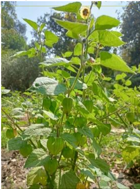
Picture: 1 Plant of Cape gooseberry

CAPE-Cape gooseberry GOOSEBERRY , ( Physalis peruviana L.) is an annual growing fruit crop belonging to the family Solanaceae. The plant of Cape-cape gooseberry is herbaceous or soft wooded plant usually reaches 2-3 feet height. Cape gooseberry is extensively grown in tropical and subtropical region of the world. The latitude ranges is about 45°S and 60°N, it can be grows at high elevation up to 500-3000m from msl-asl or (1600-9800ft). The fruit is small with (1- 3.5cm in diameter), yellow orange berry fruit enclosed by the large accrescent epicalyx and resemble tomato in shape with sweeter taste, better aroma and higher pectin content. It is also commonly called Poha or Poha berry in Hawaii, Golden berry in South Africa and Rashbhari, Makoi, Tepari, Husk cherry, Peruvian ground cherry in India. The name of Cape gooseberry is most probably derived from the name of “Cape of God Hope” of South Africa where it was commercially grown. The ripe fruits are eaten as fresh fruit and used in making excellent quality of jelly, sauces and particularly jam for which it is