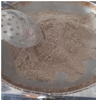
Roasting of millets