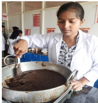
Making of chyawanprash