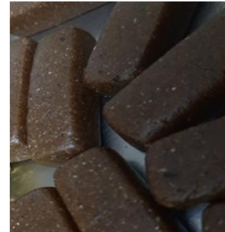
Shaping of bar