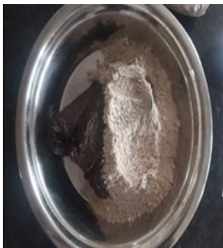
Addition of millets