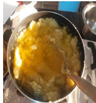
Cooking of amla pulp