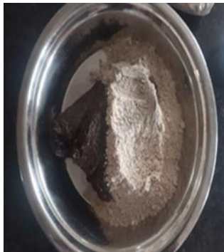
Addition of millets