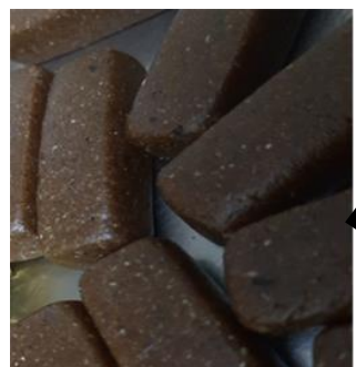
Shaping of bar