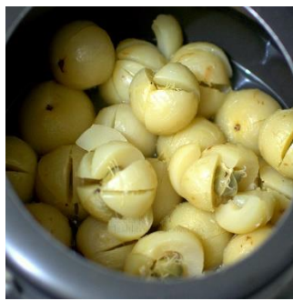
Boiling of Amla