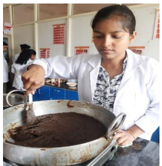
Making of chyawanprash