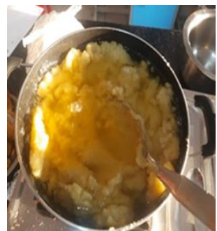
Cooking of amla pulp