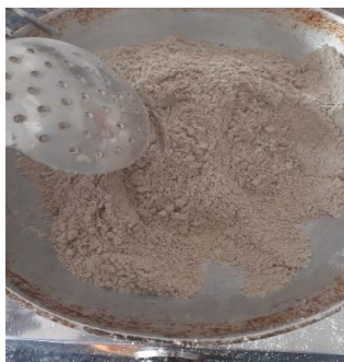
Roasting of millets