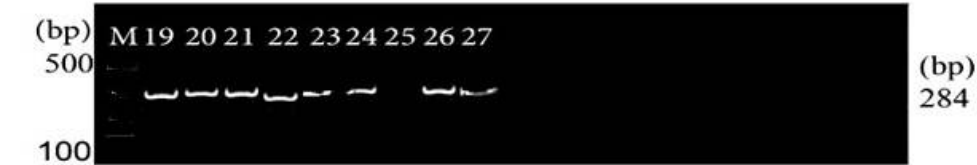
Figure 1. Agarose-gel electrophoresis displaying PCR amplicons of 284bp invA gene in 23 Salmonella isolates from human sources in Ibi Lane M, 100 bp marker; Lane 1–27, test samples (NTS); lane N, Negative control