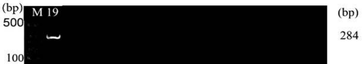
Figure 2. Agarose-gel electrophoresis displaying PCR amplicons of 284bp invA gene in 13 Salmonella isolates from human sources in Ibi Lane M, 100 bp marker; Lane 1–27, test samples (NTS); lane N, Negative control