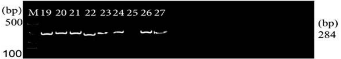
Figure 1. Agarose-gel electrophoresis displaying PCR amplicons of 284bp invA gene in 23 Salmonella isolates from human sources in Ibi Lane M, 100 bp marker; Lane 1–27, test samples (NTS); lane N, Negative control