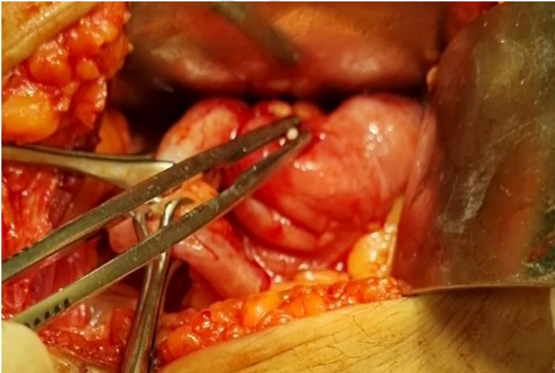
Figure 2 Exploratory laparotomy

The preoperative process was carried out and the patient was posted for an exploratory laparotomy. Uterus and both adnexa normal. However, by a palpatory method over the appendix, the vertical lines of IUCD could be felt. The IUCD was located in the abdominal cavity behind the ileocecal junction and its tip had penetrated the tip of the appendix. The whole area was edematous and covered with omentum. No fecalith impaction in the appendix was found.