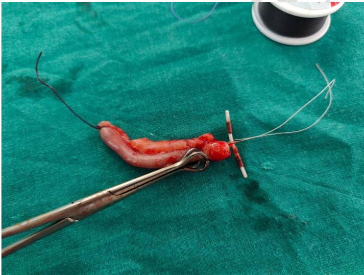
Figure 4 : Retrieved copper T penetrated into the appendix

Appendix was found to be inflamed and an appendectomy was done. Bowels were checked for injury and hemostasis achieved. The patient recovered uneventfully. Haemorrhagic fluid was present at the tip of the appendix.