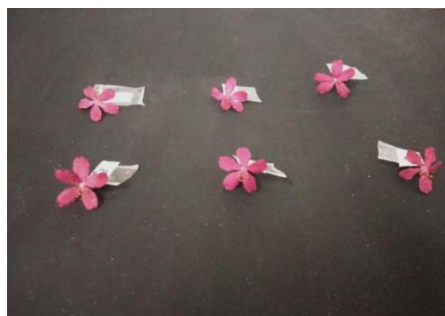
Fig 3: Before and after drying photos of jatropha in silica gel embedding media dried in microwave oven