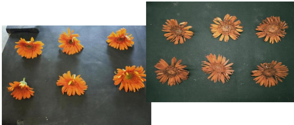
Fig 4: Before and after drying photos of gerbera in silica gel embedding media dried in microwave oven