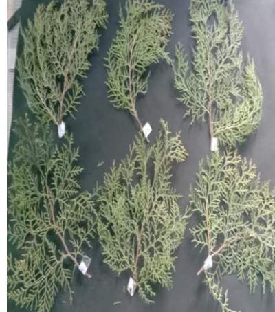
Fig 2: Before and after drying photos of thuja in silica gel embedding media dried in microwave oven