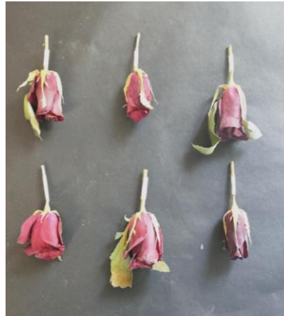
Fig 1: Before and after drying photos of rose in silica gel embedding media dried in microwave oven