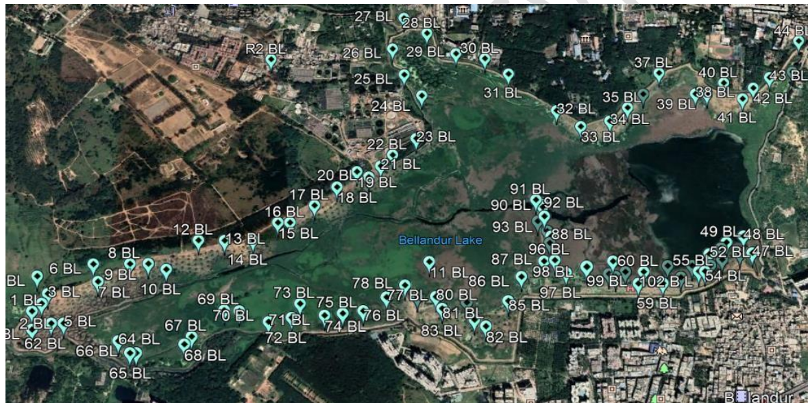
Figure 1: Sampling locations (25.12.2020) on google Maps in Bellandur Lake

The parameters like Boron, Chromium, Iron, Nickle, Copper, Zinc, Selenium, Molybdenum, Silver, Antimony Cadmium, Lead, Beryllium, Vanadium, Cobalt, Arsenic, Barium, Mercury, Thallium and Manganese for the assessment of the lake sediment quality as per the Guidance Document for Assessment and Remediation of Contaminated Site in India, issued by MoEF & CC were considered.