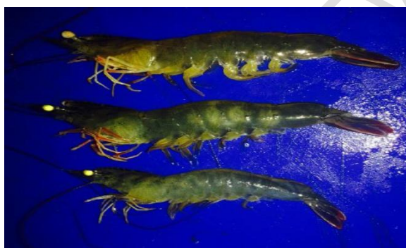
Fig. 1. Shrimp affected by WSSV.

I RECOMMEND REFERENCING IN THE TEXT FIGURES 1 AND 2 AND TABLES 1, 2 AND 3.