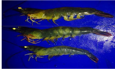
Fig. 1. Shrimp affected by WSSV.

Vannamei shrimp are susceptible to viral diseases such as Taura Syndrome Virus (TSV), also known as red tail disease. The systemic nature of TSV was first discovered in ponds near the Taura River in Ecuador. Clinical symptoms of vannamei shrimp affected by vibriosis include brownish-red hepatopancreas, red spots on the body, thin and reddish-brown tail. [9] Observed that vannamei shrimp affected by vibriosis exhibited red discoloration on the pleopod and abdomen, which appeared luminescent at night. Acute and chronic symptoms of vibriosis in vannamei shrimp are clearly visible, such as blackish back, red spots at the base of the fins, erect scales, slow movement, disturbed balance, decreased appetite, exophthalmia (protruding eyes), fluid-filled abdomen, and hemorrhagic gills, mouth, body, intestines, and internal organs. Peeling skin, sores, necrosis, and ulcers may also develop in at advanced stages.