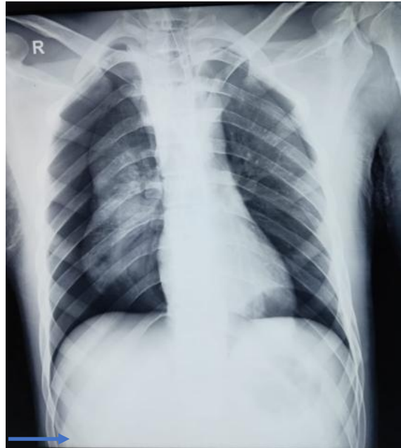
Figure 3: Chest Xray showed B/L pneumothorax

Chest X-ray was done which revealed B/L pneumothorax (Figure 3), for which B/L intercostal chest tube was inserted in Intensive Care Unit.