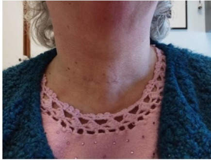
Fig. 4. Six months postoperative surgical scar.