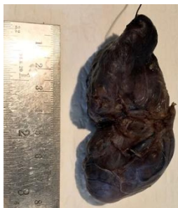
Fig. 3. Total thyroidectomy surgical specimen after conservation in formaldehyde

A total thyroidectomy was performed and intraoperatively an isolated left thyroid lobe with the macroscopic appearance of a multinodular goitre was found (figure 3) and the absence of right thyroid lobule and isthmus was confirmed. The right paratracheal space was intact. The surgical procedure went unremarkably with a normal identification of the other anatomical structures, without any unexpected findings or interurrences. The histological examination of the specimen was consistent with a multinodular goitre with colloid nodules.