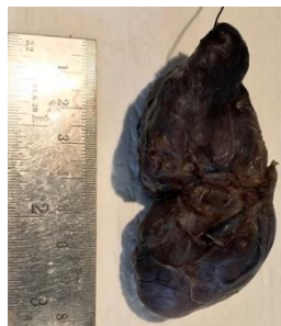
Fig. 3. Total thyroidectomy surgical specimen after conservation in formaldehyde

A total thyroidectomy was performed and intraoperatively an isolated left thyroid lobe with the macroscopic appearance of a multinodular goitre was found (figure 3) and the absence of right thyroid lobule and isthmus was confirmed. The right paratracheal space was intact. The surgical procedure went unremarkably with a normal identification of the other anatomical structures, without any unexpected findings or interurrences. The histological examination of the specimen was consistent with a multinodular goitre with colloid nodules.