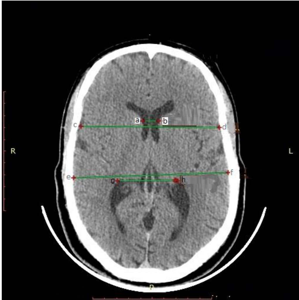
Figure 1: A CT showing measurement Bi-Frontal Index (BFI); determined by the ratio of the measured distance between the lateral borders of the frontal horns (a-b) and the transverse intracranial diameter (c-d) at the same level. Similarly, the Bi-Occipital Index (BOI) was determined by the ratio of the measured distance between the most lateral borders of the occipital horns (g-h) and the transverse intracranial diameter at the same level (e-f).