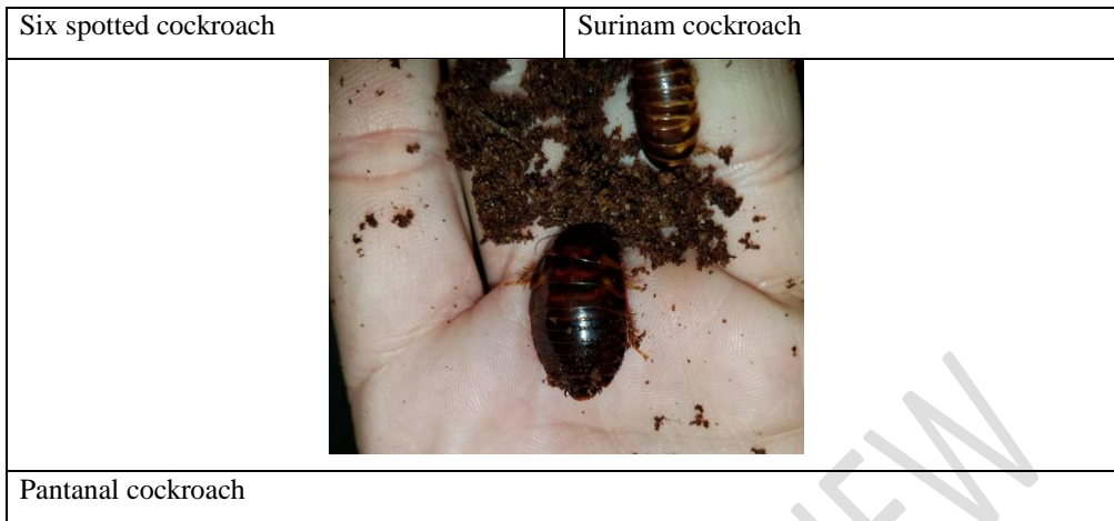
Fig. 2: Cockroaches suitable for composting (Chiarella, 1997).