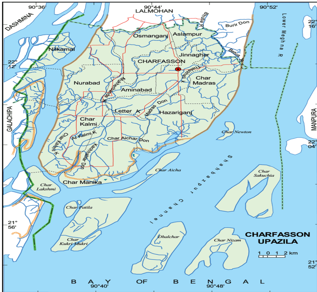
Figure 1. Location map of the study area