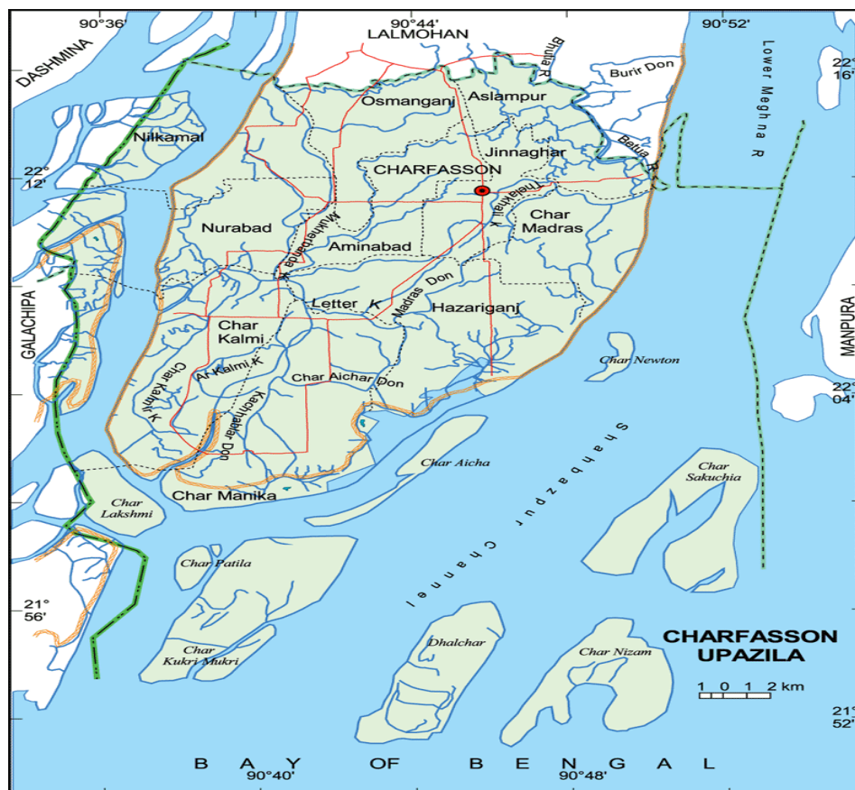
Figure 1. Location map of the study area