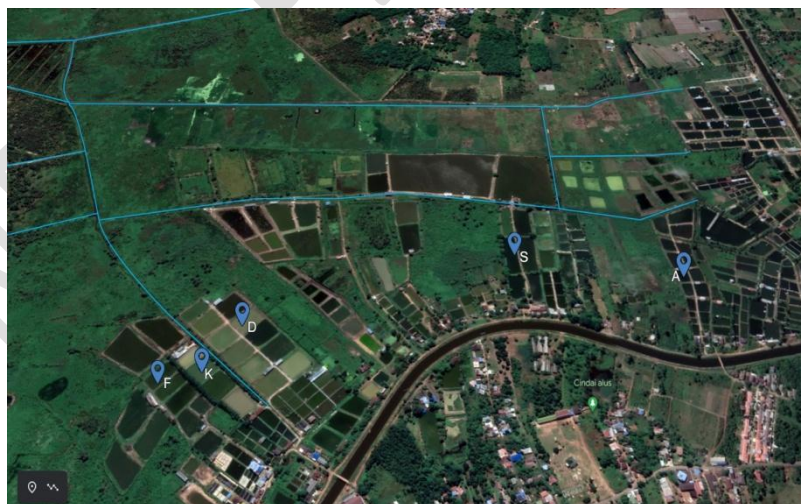
Figure 2. Geographical Location Map

The population in this study is based on the area of catfish cultivation using the classification of a large business pond with an area of more than 10,000 m 2 (Febrianty, 2019). The sample used in this study, namely using 5 representative catfish cultivators based