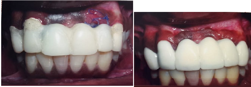
Fig. 3a After 7days with temporary restoration

Patient was instructed to report after 24 hours of surgery and then after 7 days and 4 months. (Fig. 3b) The temporary bridge was replaced with permanent bridge two months after surgery. There was reduced labial concavity in 21,22 region (Fig 3b).