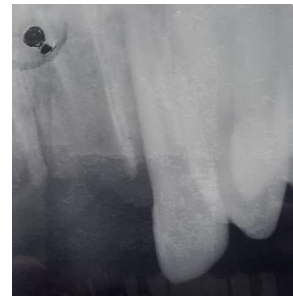
Fig.1c Radiograph of 23 showing sufficient bone

The initial preparation phase for treatment consisted of oral hygiene instructions, scaling and root planing followed by root canal treatment of 12 and occlusal corrections. Re-evaluation were done 6 weeks after the completion of this first phase of therapy. Routine blood investigation was normal. In teeth 13,12,23 abutment preparations were performed for placing temporary bridge.