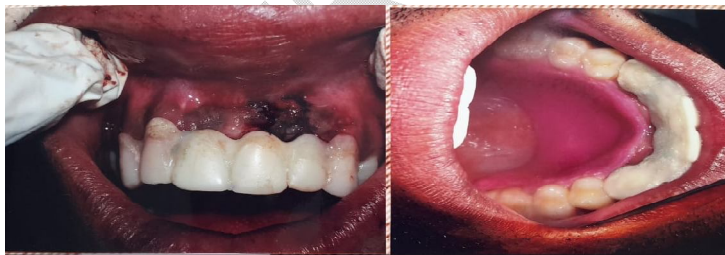
Fig.2d Immediately placed temporary restoration and cover plate placed in donor site.