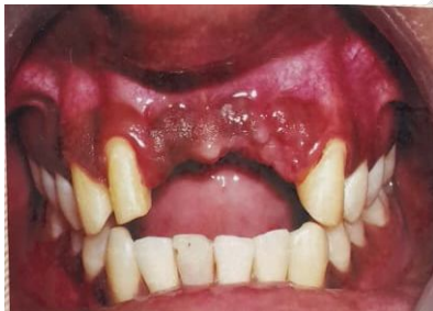
Fig. 1a. Initial View

A 16 years old male patient visited in dental outpatient department for replacement of missing upper anterior teeth. He gave a history of trauma during swimming causes loss of upper anterior teeth about one month back. On examination, it was observed that the patient had lost 11, 21 and 22. 12 was one degree mobile and slightly extruded. Overall oral hygiene was good and gingiva appeared healthy. There was Allen Class B ridge defect present labial to 21 and 22 regions.(Fig.1a) Intra-oral Periapical radiograph (IOPR) showed 12 was slightly extruded (Fig.1b) and sufficient bone support was found around 23 region.(Fig.1c) The whole treatment plan was explained to the Patient and patient's relatives and their consent was taken in a consent form. The patient was instructed for proper plaque control to eliminate periodontal inflammation and if he was a smoker for smoking cessation, since cigarette smoking plays a major role in the outcome of periodontal plastic surgery. [6,7]