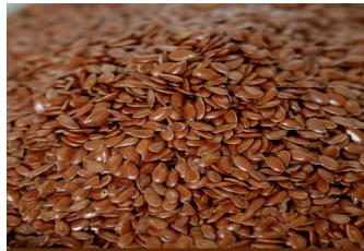
Plate III: Flaxseeds

Whole flaxseeds have a lovely nutty flavor and a crispy and chewy texture both as dietary supplements and as ingredients in different meal preparations. It contains Fats, high-quality proteins, and dietary fiber abundantly, flax plant has a sizable amount of the fiber which is water-soluble and viscous in nature (14).