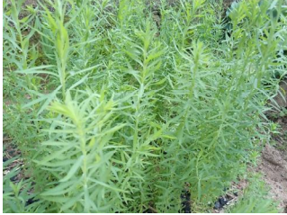
Plate I: Fresh flax plant