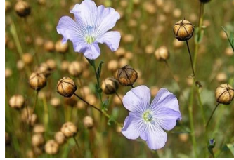
Plate II: Dry flax stalk with capsule and flower