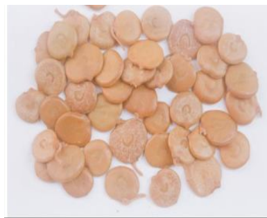
Pic 1. Supervision of planted seedlings in a nursery Pic 2. Seed of Acacia senegal