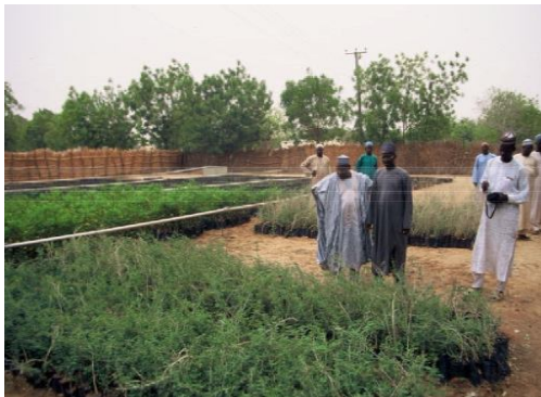
Pic 1. Supervision of planted seedlings in a nursery

Acacia seeds are dormant and hard and needs to be given some sort of pre-treatment for them to germinate faster. This has been reported by Mohammed et al. , (2017) , that generally members of the Leguminosae family have hard seed coat and contain less moisture. Adequate and dependable supply of water is needed during nursery sittings for adequate growth of the seedlings. Plants must be watered morning and evening daily by hand or irrigation system (Shettima et al. , 2017).