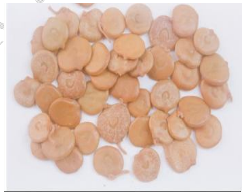
Pic 2. Seed of Acacia senegal