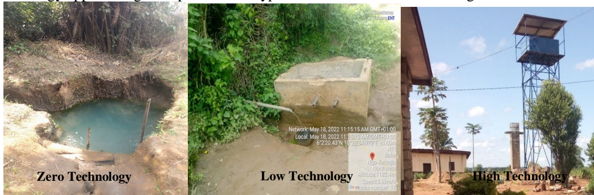
Figure 3: Types of Domestic Water Harvesting Infrastructures in the Upper Noun

Table 3 presents a general overview of the quality of infrastructural development by stakeholders of the water sector in the Upper Noun Valley. It is observed that most of the technology used for procuring domestic water for the population is largely low or indigenous (73.64%) than the high or modern technological infrastructure. It was also observed that, 38% of springs in the valley area are being harnessed as pipe borne sources. Few wells (19%) are equipped with modern devices and most of the wells (81%) are operated manually in the process of water collection. Ponds are not developed into high technology systems and it is use locally with little or no technology applied. Figure 3 presents the types of domestic water harvesting infrastructures.