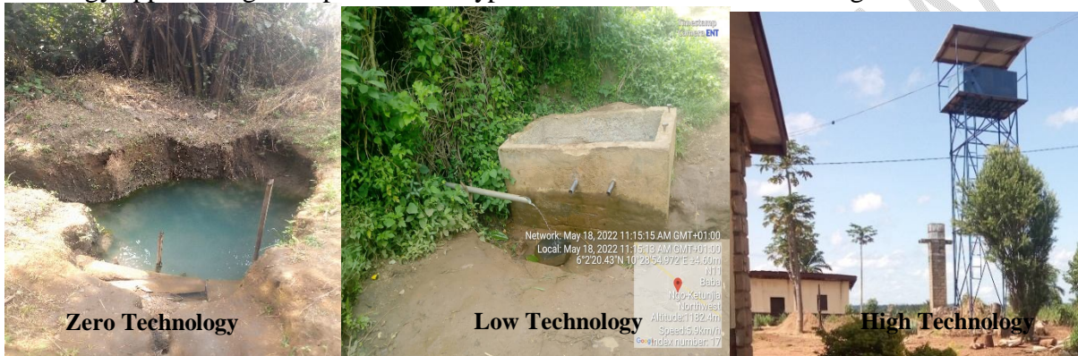
Figure 3: Types of Domestic Water Harvesting Infrastructures in the Upper Noun

Table 3 presents a general overview of the quality of infrastructural development by stakeholders of the water sector in the Upper Noun Valley. It is observed that most of the technology used for procuring domestic water for the population is largely low or indigenous (73.64%) than the high or modern technological infrastructure. It was also observed that, 38% of springs in the valley area are being harnessed as pipe borne sources. Few wells (19%) are equipped with modern devices and most of the wells (81%) are operated manually in the process of water collection. Ponds are not developed into high technology systems and it is use locally with little or no technology applied. Figure 3 presents the types of domestic water harvesting infrastructures.