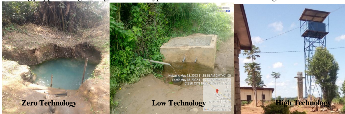
Figure 3: Types of Domestic Water Harvesting Infrastructures in the Upper Noun

Table 3 presents a general overview of the quality of infrastructural development by stakeholders of the water sector in the Upper Noun Valley. It is observed that most of the technology used for procuring domestic water for the population is largely low or indigenous (73.64%) than the high or modern technological infrastructure. It was also observed that, 38% of springs in the valley area are being harnessed as pipe borne sources. Few wells (19%) are equipped with modern devices and most of the wells (81%) are operated manually in the process of water collection. Ponds are not developed into high technology systems and it is use locally with little or no technology applied. Figure 3 presents the types of domestic water harvesting infrastructures.