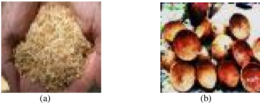
Figure 1: Samples of (a) Rice husk, (b) Coconut shell.

The raw materials used for this experiment include rice husk as the base compound, coconut shell as energizer, cassava starch as binder, and water as a processing material. The rice husk was collected from Wurukum rice mill, and the coconut shell from Railway market, both in Makurdi, Benue State. Figure 1 shows samples of the rice husk (a), and coconut shell (b).