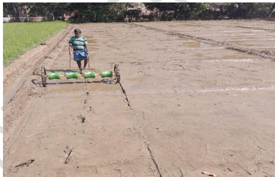
Figure 2. Drum seed sowing