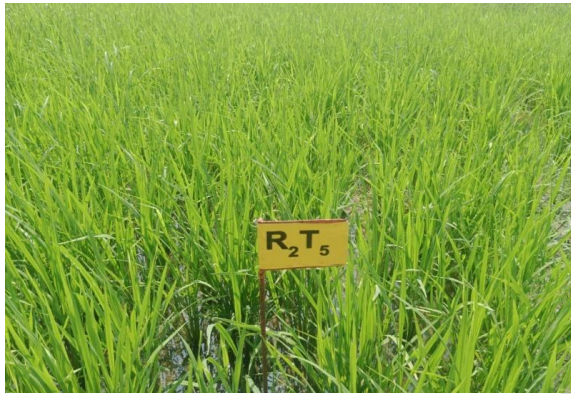
Figure 3. T 5 - Pyrazosulfuron ethyl 10% WP @ 20 g ha -1 on 3 DAS fb Bispyribac sodium 10% SC @ 25 g ha -1 on 20 DAS fb Power weeder at 30 DAS fb Hand weeding at 45 DAS