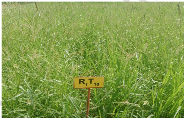
Fig 4. T 10 – Weedy Check (Control)