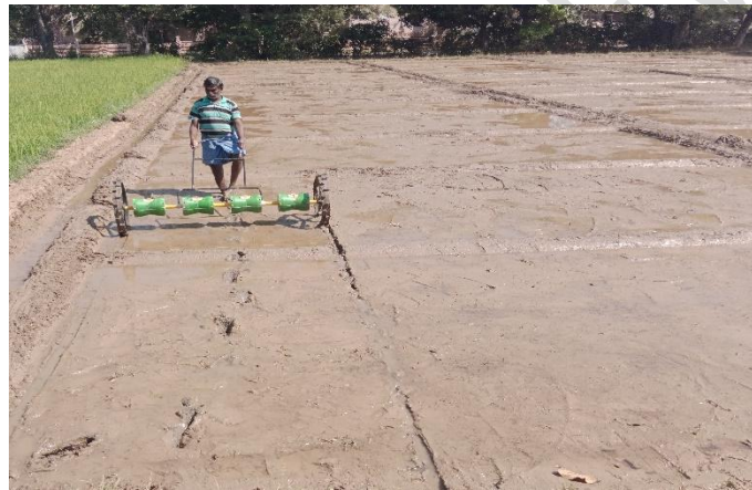
Figure 2. Drum seed sowing