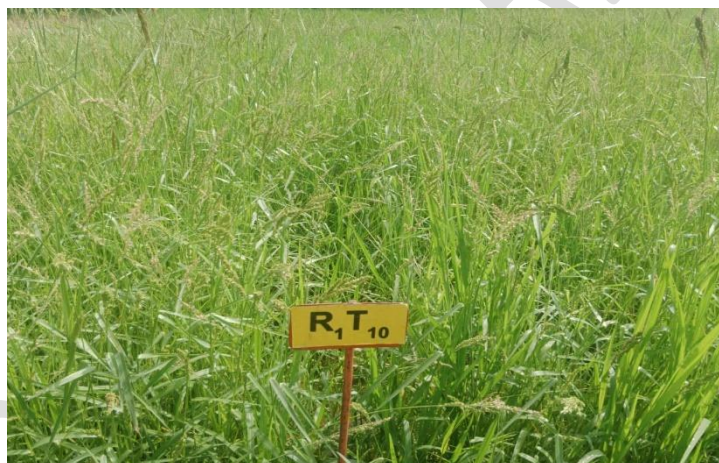
Fig 4. T 10 – Weedy Check (Control)