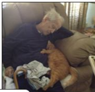
Provide Comfort and Warmth