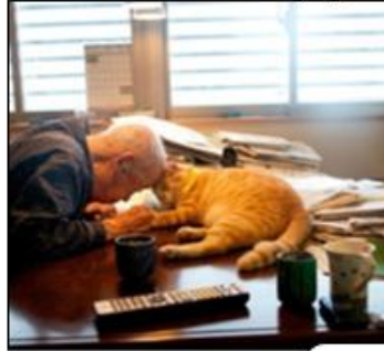
Ease Loneliness and Longingnes

Based on the analysis of the gathered data, three emergent themes were identified to categorize the insights shared by the widowers. The themes include: (1) ease loneliness and longing ; (2) provide comfort and warmth ; and (3) provide entertainment and happiness .