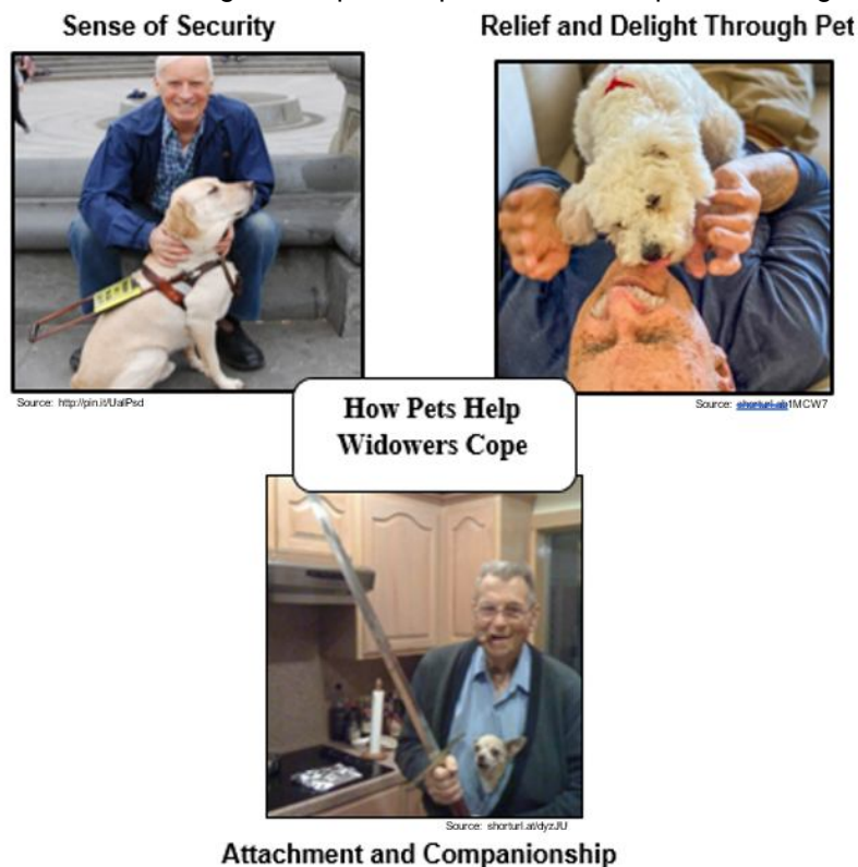
Figure 2. Theme Illustration of How Pets Helped Widowers Face challenges

This section presented the themes that emerged in the attempt to determine how having pets have helped widowers cope with the challenges they face after losing their wives. Based on the findings, three themes, namely; (1) sense of security ; (2) relief and delight through pets ; and (3) attachment and companionship . A theme illustration was crafted to facilitate a visual understanding of how pets helped widowers cope with losing their wives.