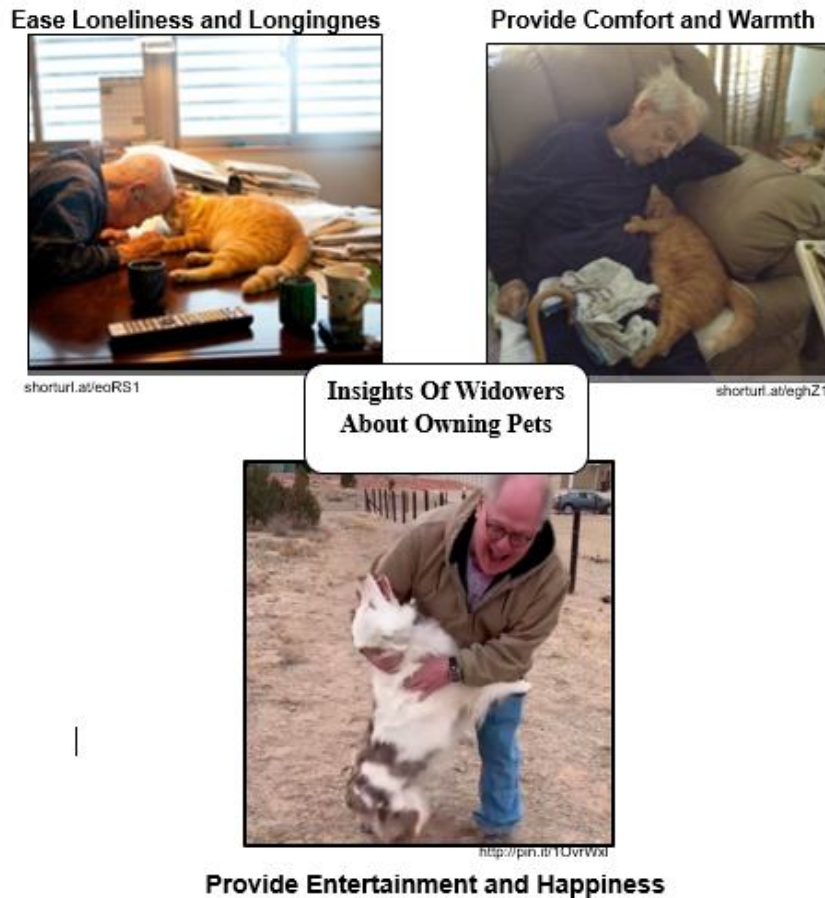
Figure 3. Theme Illustration Insights of Widowers About Owning Pets

the death of their loved ones, the warmth they provide, and the happiness they offer to the pet owners. A thematic illustration of the themes can be found in Figure 3.