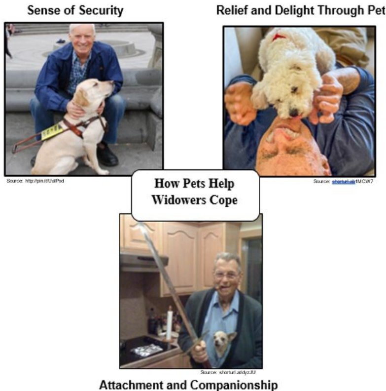
Figure 2. Theme Illustration of How Pets Helped Widowers Face challenges

This section presented the themes that emerged in the attempt to determine how having pets have helped widowers cope with the challenges they face after losing their wives. Based on the findings, four (4) themes, namely; (1) sense of security ; (2) relief and delight through pets ; and (3) attachment and companionship . A theme illustration was crafted to facilitate a visual understanding of how pets helped widowers cope with losing their wives.