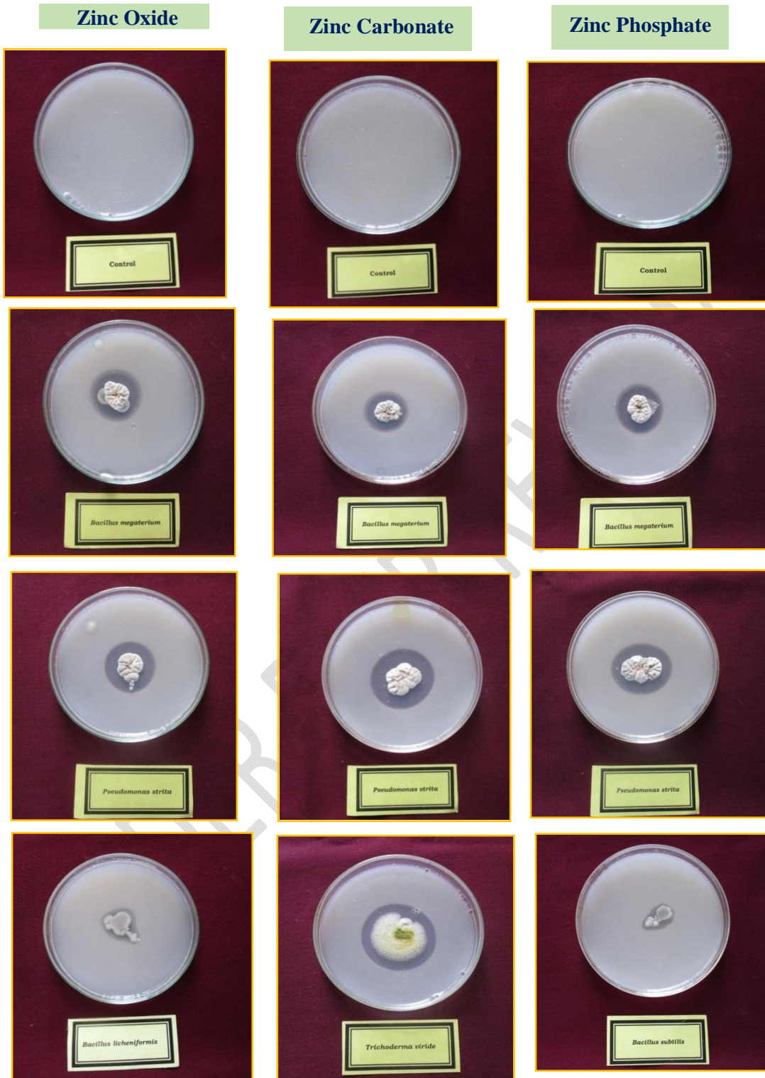
Plate 1: Zinc solubilization potential of different plant growth promoting microorganisms using Pikovskayas agar medium with ZnO, ZnCO 3 and Zn(PO 4 ) 2 insoluble zinc source.