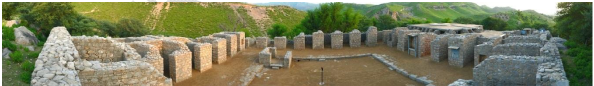
Figure 1: Ruins of the Taxila Buddhist Monastery, present-day Pakistan.