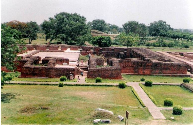
Figure 2: Ruins of the Buddhist Monastery of Nālandā, present-day India.