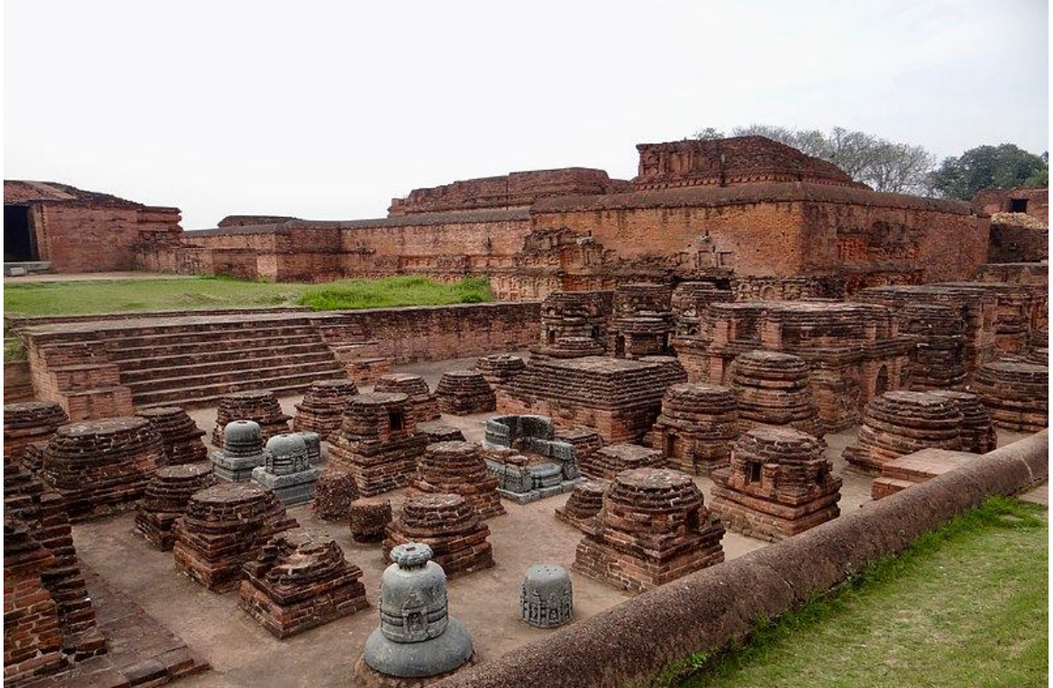
Figure 4: Ruins of Nālandā Monastery.