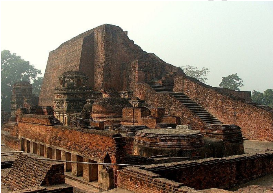
Figure 3: Ruins of the Buddhist Monastery of Nālandā, present-day India.