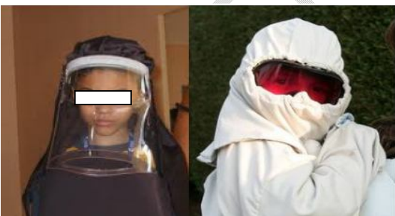
Fig. 7. Types of protection UV

The XP treatment imposes a report on sun and UV exposures. This is to avoid maximum exposure to the sun all day long. Therapeutic patient education plays an important role in protecting all body surfaces from UV radiation. Among the practices used by these children, wearing protective clothing, sunscreens, UV-absorbing glasses, and a long haircut. Some patients wear custom hats that absorb UV.