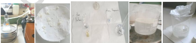
Fig. 1. Preparation of microcapsules

Phase A: ethylcellulose (300 mg) was dissolved in ethyl acetate (5 ml) under continuous stirring (1500 rpm). Then, 700 mg of jojoba oil were-was added to this solution. The stirring was maintained, after that, for 15 min. Phase B: sodium lauryl sulfate (500 mg) was dissolved in water (50 ml). 6 ml of ethyl acetate was added to this aqueous solution under a continuous stirring (1500 rpm). Next, phase A was dropped into phase B. 100 ml of water were-was added to the formed emulsion to extract the organic solvent. The formed microcapsules were isolated by filtration, washed five times with distilled water, and dried at 40 °C for 12 h.