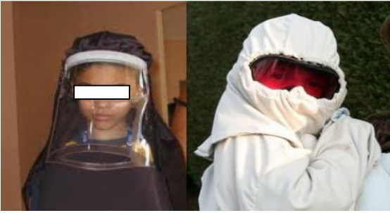
Fig. 7. types of protection UV

radiation. Among the practices used by these children, wearing protective clothing, sunscreens, UV-absorbing glasses, and a long haircut. Some patients wear custom hats that absorb UV.