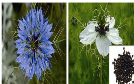
Fig. 4. Nigelle sativa plant

N.sativa have wide range of pharmacological effects; immune-stimulatory, anti-inflammatory, hypoglycemic, antihypertensive, antiasthmatic, antimicrobial, antiparasitic, antioxidant and anticancer effects [19].