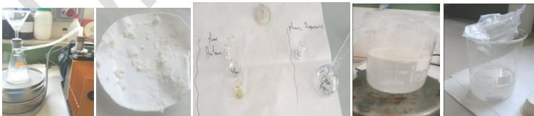
Fig. 1. Preparation of microcapsules

Phase A: ethylcellulose (300 mg) was dissolved in ethyl acetate (5 ml) under continuous stirring (1500 rpm). Then, 700 mg of jojoba oil were added to this solution. The stirring was maintained, after that, for 15 min. Phase B: sodium lauryl sulfate (500 mg) was dissolved in water (50 ml). 6 ml of ethyl acetate was added to this aqueous solution under a continuous stirring (1500 rpm). Next, phase A was dropped into phase B. 100 ml of water were added to the formed emulsion to extract the organic solvent. The formed microcapsules were isolated by filtration, washed five times with distilled water and dried at 40 °C for 12 h.