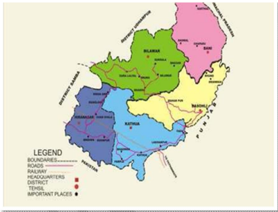
Fig 1: Location of study area

Method of implementation of resource conservation techniques: