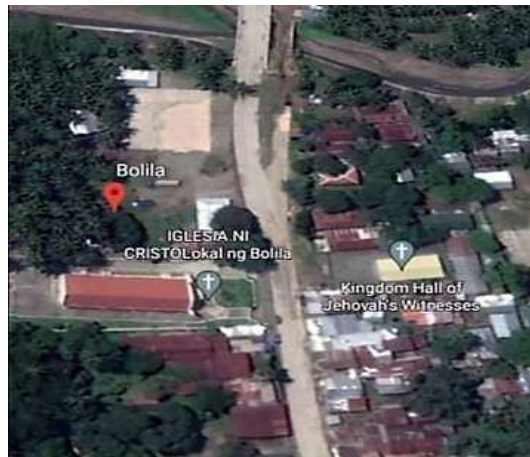
Fig 1. Location Map of Barangay Bolila, Malita, Davao Occidental

This study was conducted in Barangay Bolila, Malita, Davao Occidental. The area, is safe and can be a good study area since it can acquire full sunlight of the sample vegetable. The experiment was conducted in a greenhouse at Barangay Bolila, Malita, Davao Occidental 40°02' N, 28°23' E: 462.2 m above sea level.