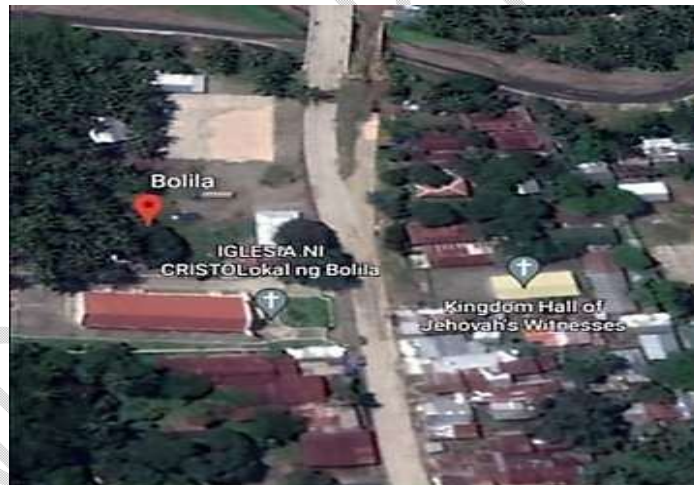
Fig 1. Location Map of Barangay Bolila, Malita, Davao Occidental

This study was conducted in Barangay Bolila, Malita, Davao Occidental. The area is safe and can be a good study area since it can acquire full sunlight for the sample vegetable. The experiment was conducted in a greenhouse at Barangay Bolila, Malita, Davao Occidental 40°02' N, 28°23' E: 462.2 m above sea level.