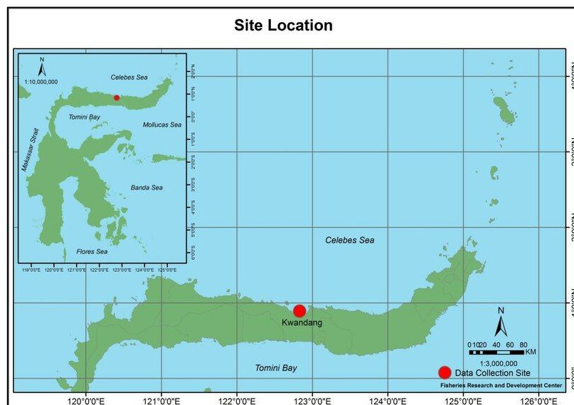
Fig. 1. Indian Mackerel Fishing Grounds in the Coastal Waters of Gorontalo

The tools used in this study include cool box, electric scales, stationery, a camera, sample paper, a petri dish, dissecting set, a microscope, a pipette, and a beaker glass. The ingredients used include Indian Mackerel ( Rastrelligerkanagurta ), 100 ml of water, and ice cubes.