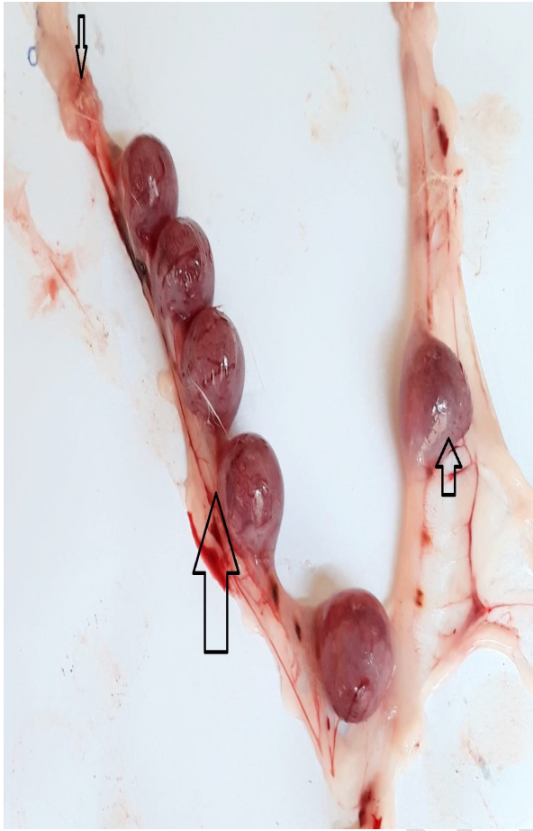
Fig. 2. 250mg/kg treatment ↑ (Stunted embryo), ↓; Ovary

. Figure 2 and 3 showing stunted growth of fetuses and abortion.