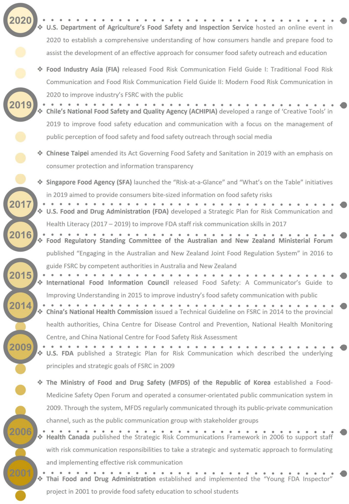
Figure 1. Examples of FSRC efforts by competent authorities and food industry of the APEC region between 2001 and 2020