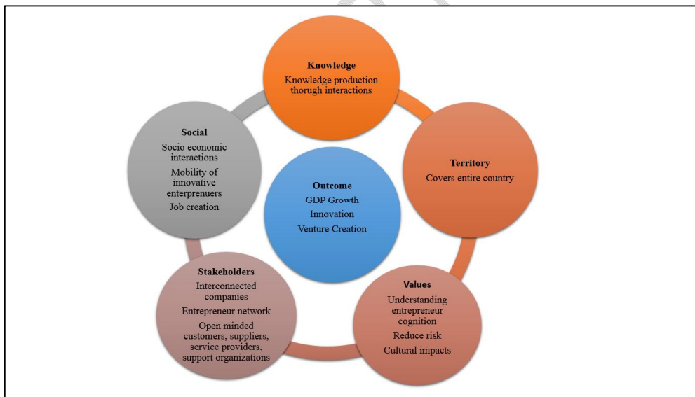
Figure 1: Factors influencing and outcome of entrepreneurship ecosystem

Comment [PDHHABbM12]: Pls add the recent literature?