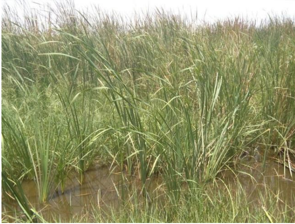
Photo C. Typha australis in the Lake Guidimouni