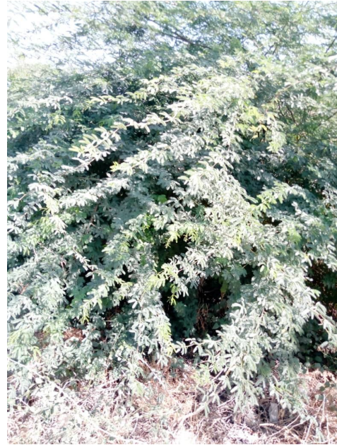
Prosopis juliflora in the lake basin