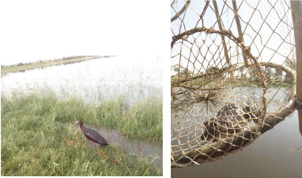
Photos A. Ciconia nigra and frog trapped by a poacher by the lake.

caused by the use of chemicals (pesticide and chemical fertilizers) which come from irrigated farming activities near the lake (Photo b); (v) climate change represented by drought as reported by the respondents; (vi) plant invasion ( Typha australis Schum et thonn and Prosopis juliflora (Sw.) DC. (Photo c)), (vii) deforestation which leads to silting up of the lake as illustrated in the photo (d).